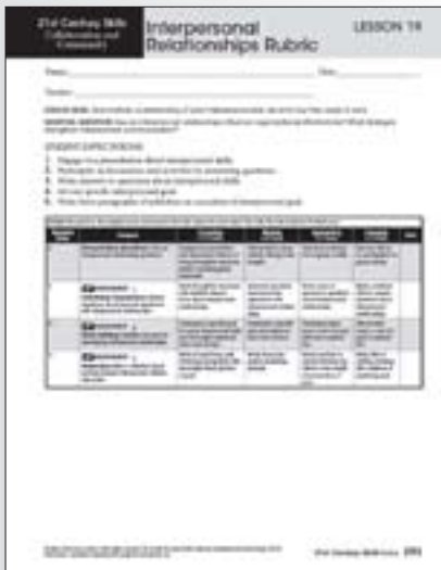
Interpersonal Relationships Rubric