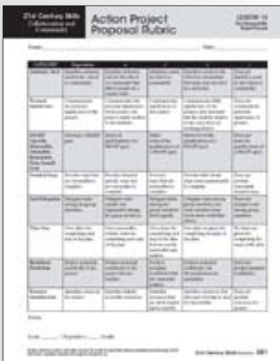
Action Project Proposal rubric