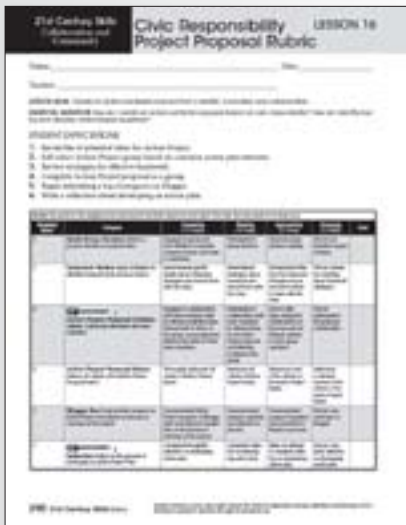
Civic Responsibility Project Proposal Rubric