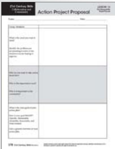
Action Project Proposal