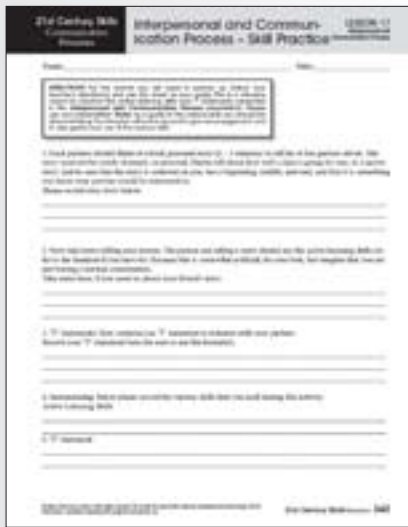
Interpersonal and Communication Process – Skill Practice