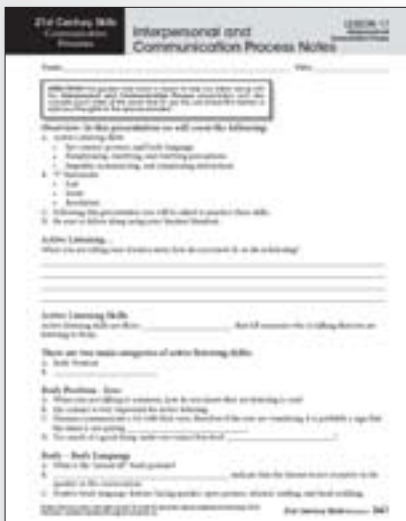
Interpersonal and Communication Process Notes