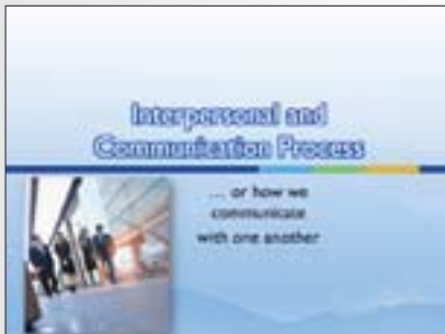
Interpersonal and Communication Process