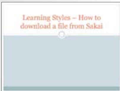
How to Download a File from Sakai