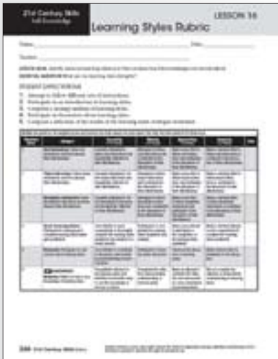
Learning Styles Rubric