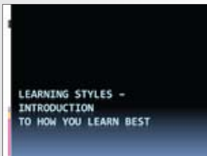
Introduction to How You Learn Best