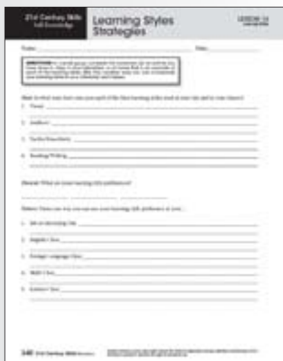
Learning Styles Strategies