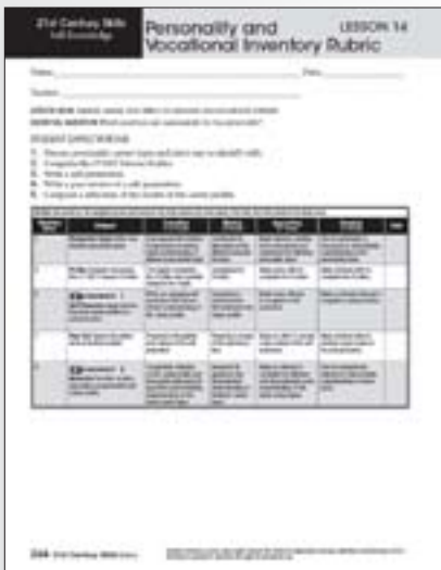
Personality and Vocational Inventory Rubric