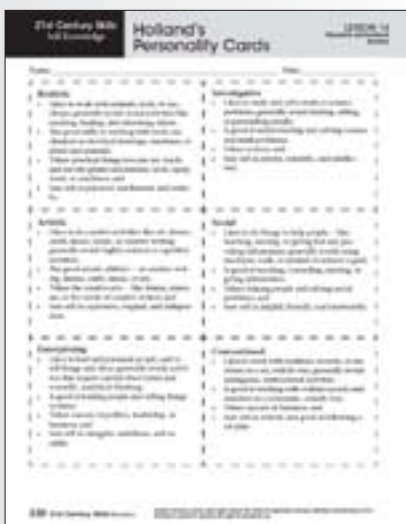
Holland's Personality Cards