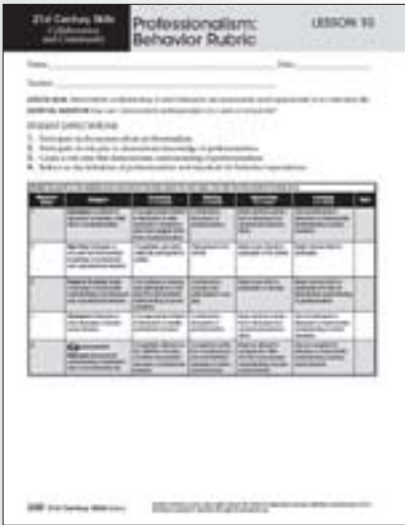
Professionalism: Behavior Rubric