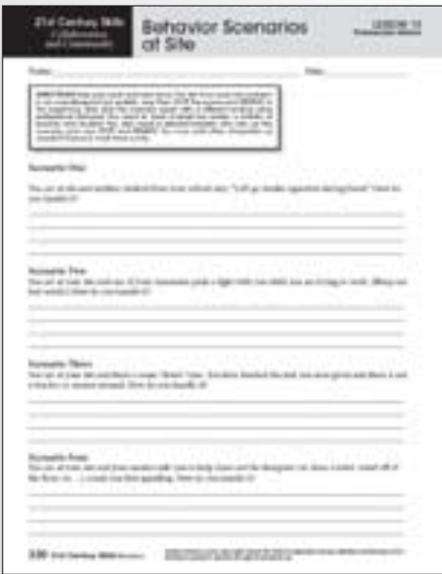
Behavior Scenarios at Site